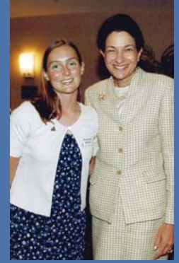
Hon. Hillary Clinton (D-NY) and Hon. Olympia Snowe (R-ME) participated in OFA's Capitol Hill media events.